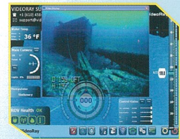
Visual at Underwater